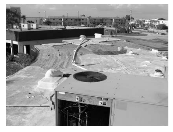
Figure 5: Substrate failure. Deck remained intact, underlying built-up roof peeled up taking SPF recover with it.

The typical mode of substrate failure was a loosening of the windward edge followed by a peel-back of the membrane. Depending on the security of the underlying insulation, the peelback may or may not take insulation boards with it. At some point in the peel-back process, the membranes typically ruptures, leaving the remaining substrate and SPF intact.