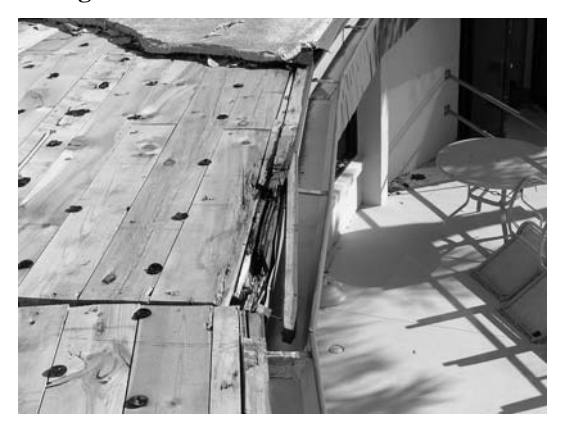
Figure 6: Substrate failure close-up. Edge nailer was rotted and built-up roof was insufficiently fastened.