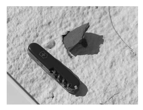
Figure 7: Surface damage (missile impact).

Surface damage of SPF roof systems occurred where wind-borne missiles (such as tree limbs and broken ceramic roof tiles) impacted the SPF. Gravel scour occurred at windward roof corners, and in some cases, near roof protrusions and roof mounted equipment. Little or no loss in waterproofing resulted from surface damage.