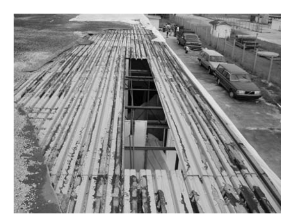
Figure 4: Deck failure. An overhead door failed immediately below the location of this deck failure.

Roof decks are commonly constructed of concrete, steel or plywood. Decks provide the structural support for the waterproofing and insulating components of the roofing system. Deck failure results from high pressure differentials.