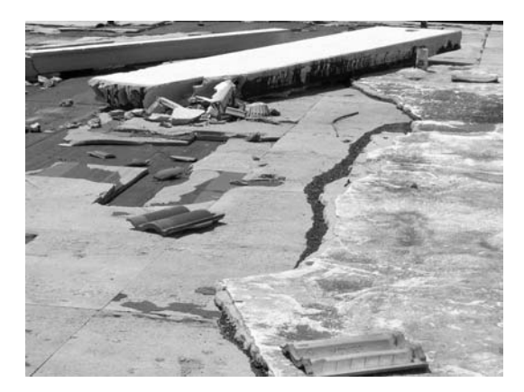
Figure 3: Three modes of failure are evident on this SPF recover of a built-up roof. (1) Deck (hollow-core concrete panels at top); (2) Substrate (built-up roof at left foreground); and (3) Surface Damage (at right foreground).

Thus, in comparing a Category 4 storm (Charley) with a Category 2 storm (Frances), the wind speed might be 40 % greater; the pressure ratio woud be approximately 100 % greater; and the potential damage would be 25 times greater.