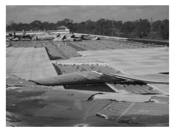
Figure 9: This SPF patch (right-middle of photo) was installed after Hurricane Frances. Hurricane Jeanne damaged the remaining roof, leaving the SPF patch intact.